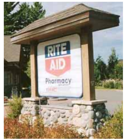
Above: Examples of ground signs.